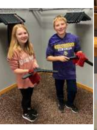
Helpers of all ages came for the fall cleanup day

Water damage in a classroom from an ice dam