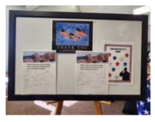
Veteran recognition in narthex on November 12