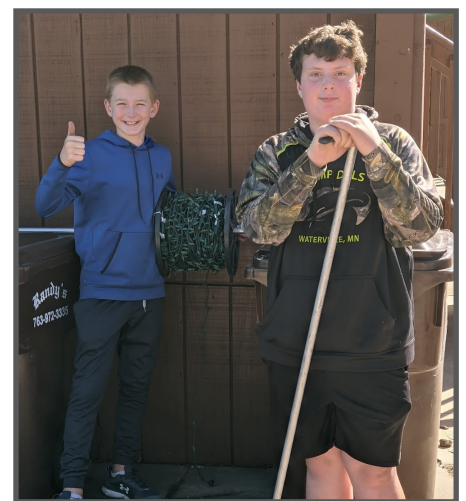
Confirmation group helps set up at Delano Light the Night