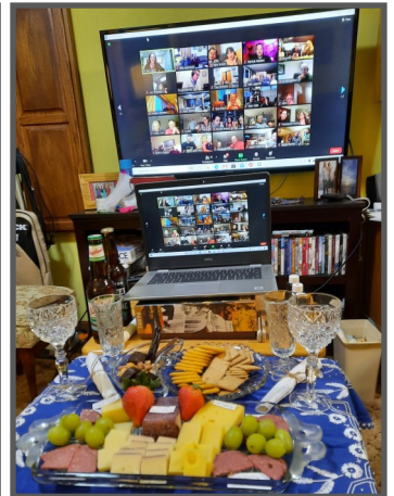
Youth fundraiser on Zoom