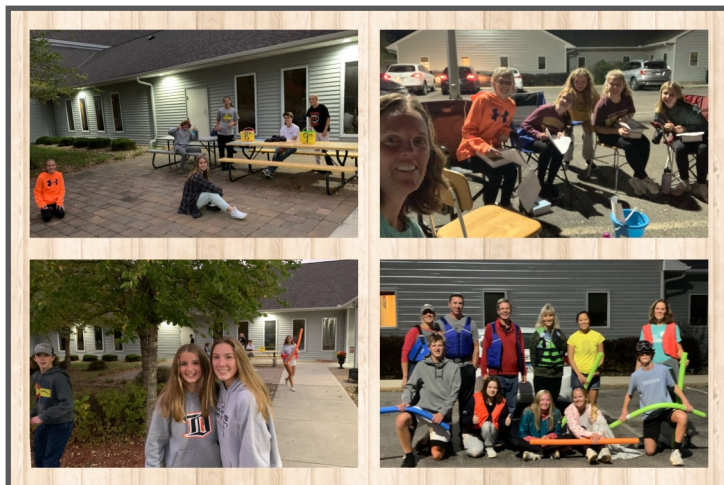
Youth Mission Trip to Colorado (left and middle pictures above); outdoor confirmation last fall (right)