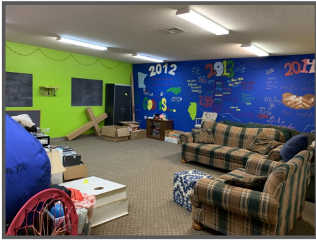
Before, during, and after the youth room remodeling project