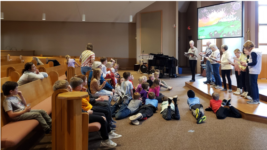
The Voyagers group loves listening to and interacting with our Readers Theater (and vice versa).