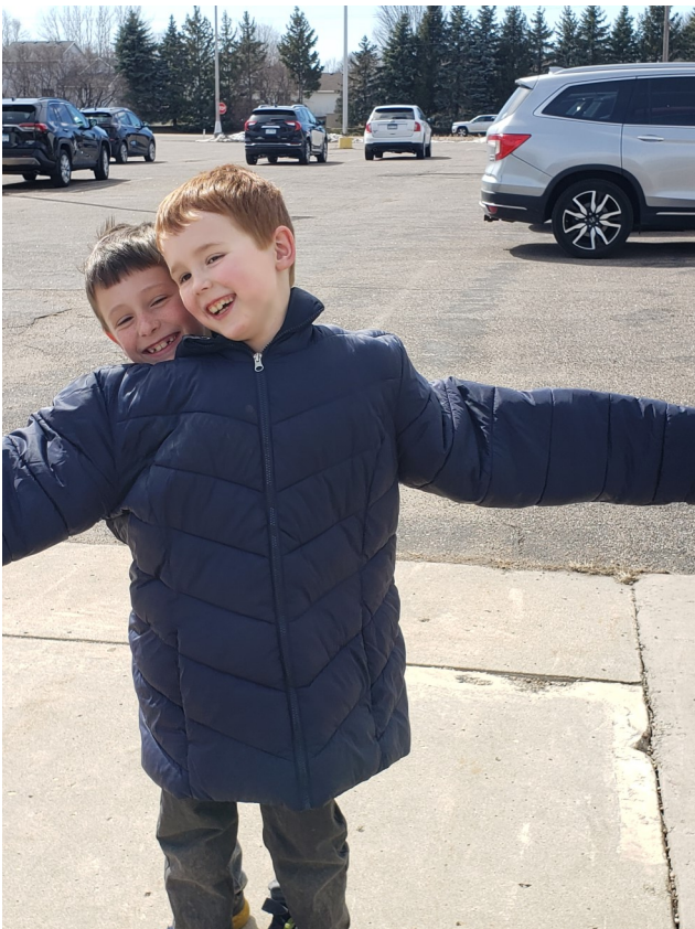
When the wind is cool and have only one coat, friends share!