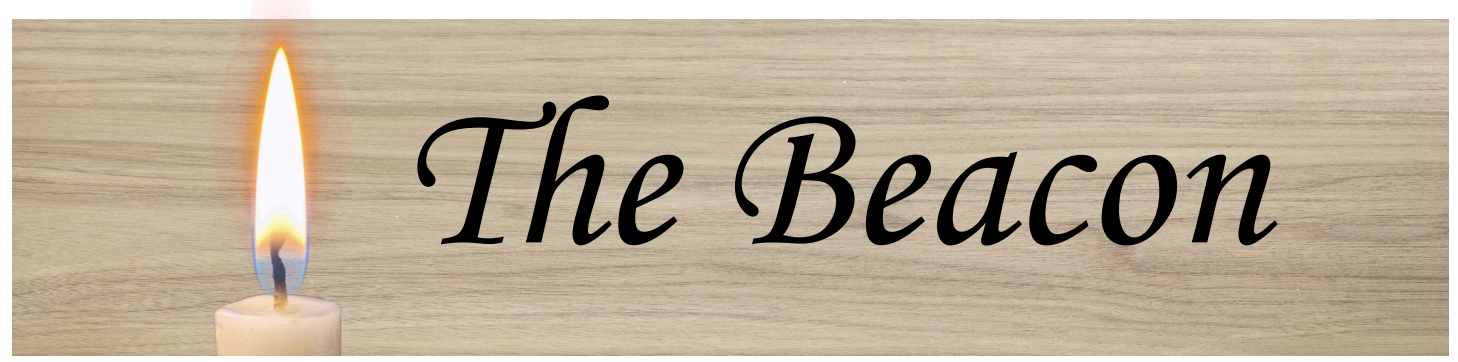
November 1, 2019 Lightofchristlutheran.com