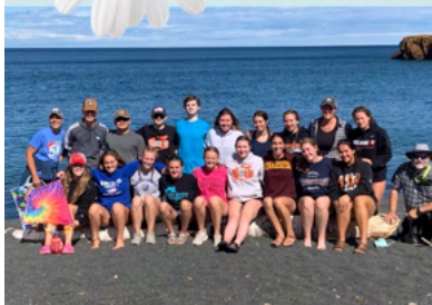
HS Service Trip, July 23-29, 2022