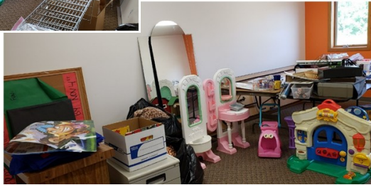
Table Talk Summary