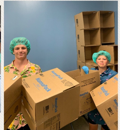
Feed My Starving Children Service Event