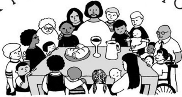
A PLACE FOR YOU ↗