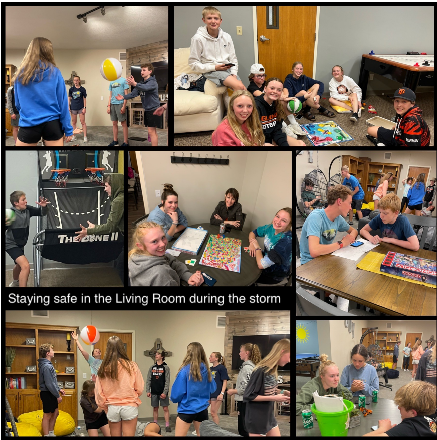
Staying safe in the Living Room during the storm