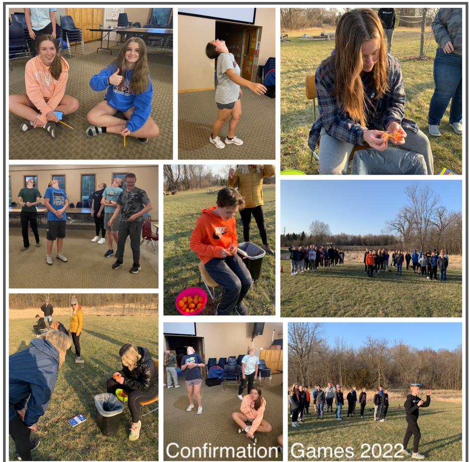
Confirmation Games 2022

We've enjoyed lots of games together with our Confirmation Youth & Guides this spring! Youth have competed in a relay race by grade... balancing a book on their head, eating an orange and racing back. They've also had to be the last person "standing" while balancing a pencil on their chin. It's great to be able to spend time having fun together at church!