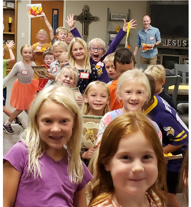
Sunday morning Explorers