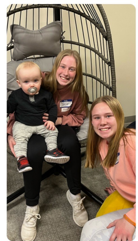
Parent's Night Off event 2/25/23 🚖