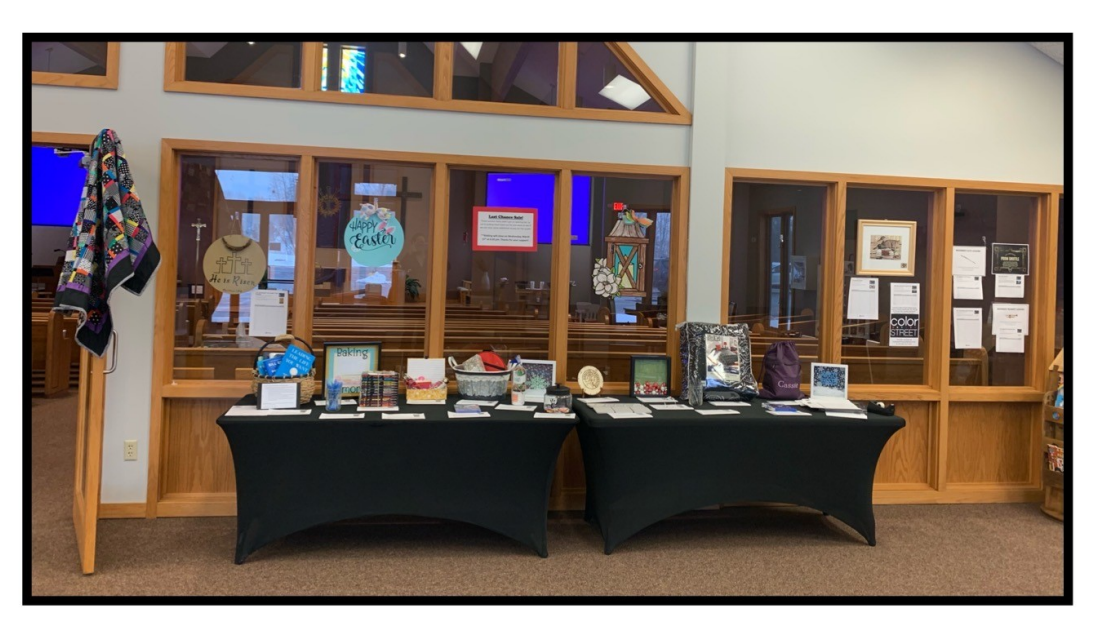
Last chance items... Bid in person through 8:30 pm on 3/15!