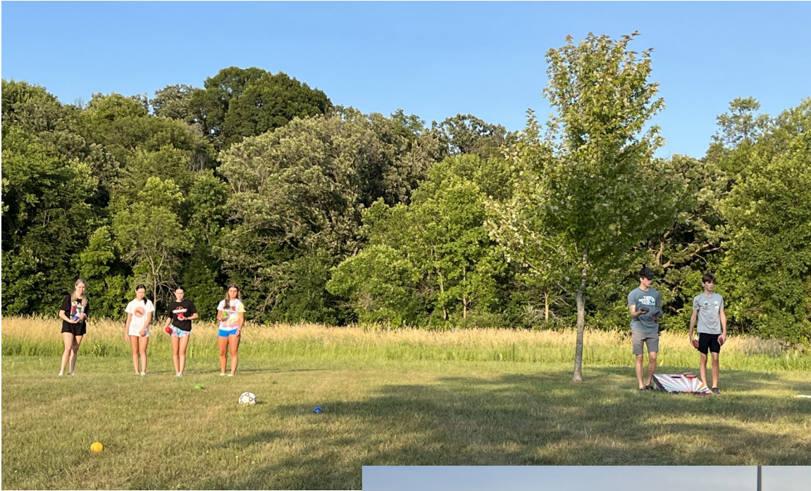
Bocce ball and beanbags