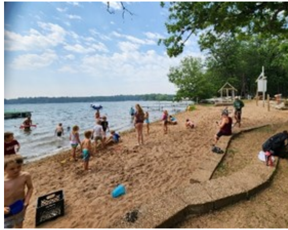
Wonderful time swimming and playing games

So excited to share the fun playing games, swimming, eating pizza having popsicles, making new friends