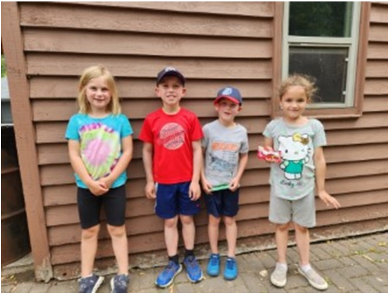
The Happy 1-Day Campers