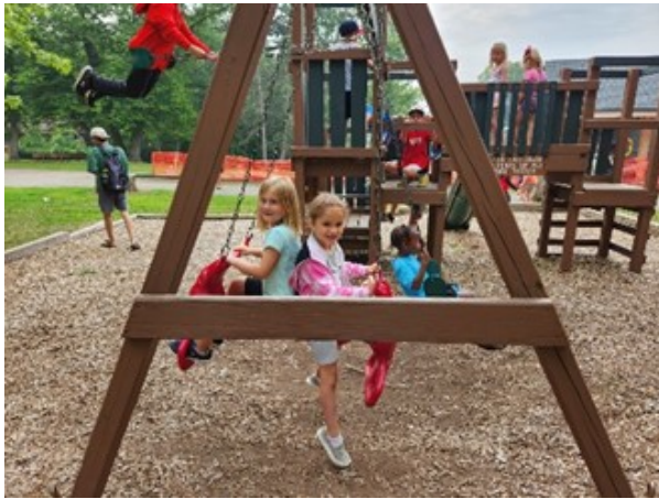
Made new friends