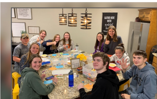
HS Fellowship for grades 9-12 starting again on Sunday nights!

When: Once a month on Sunday nights typically the last Sunday of the month. Future dates will be 2/25, March is TBD (with spring break and Easter), and 4/28. May is also TBD.