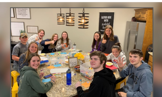
HS Fellowship for grades 9-12 starting again on Sunday nights!

When: Once a month on Sunday nights typically the last Sunday of the month. Future dates will be 2/25, March is TBD (with spring break and Easter), and 4/28. May is also TBD.