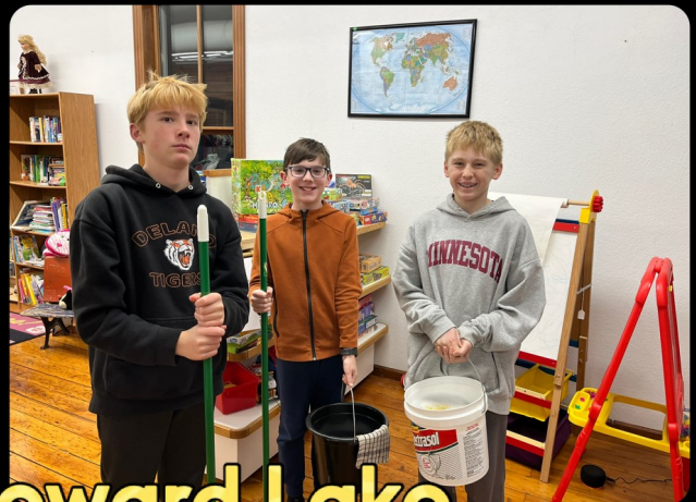
Love INC, Howard Lake