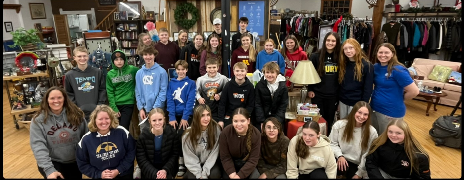
Serving at Love INC, Howard Lake - 12/11/ 24