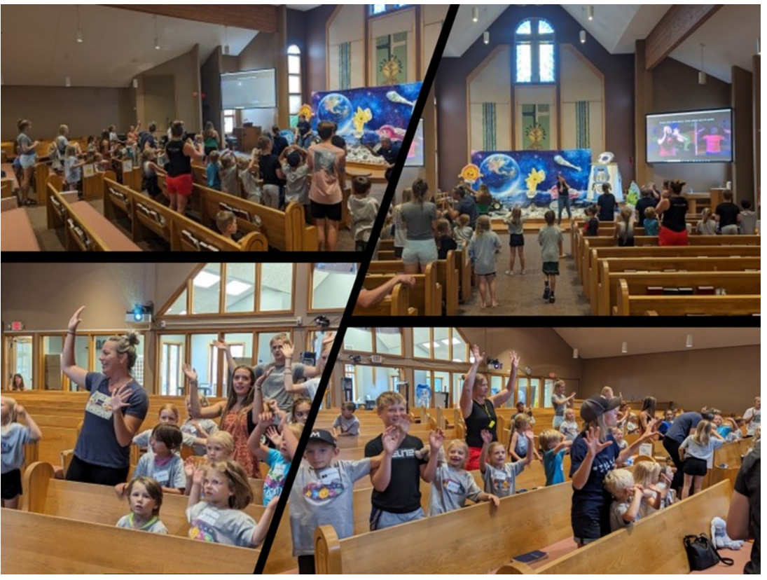
(VBS pictures continued on page 4)