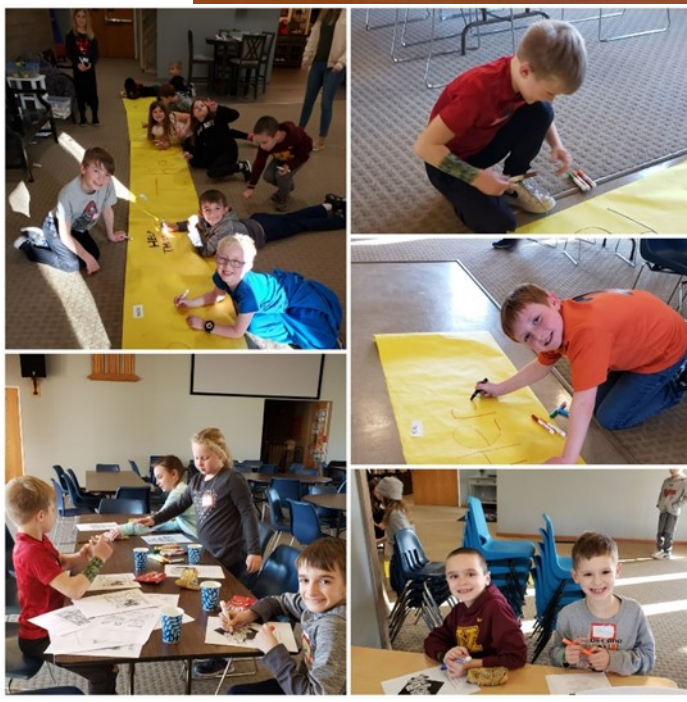
Our Voyager group made pew banners and posters for the March Pack the Pews Food Share!

Pathfinders will be collecting food items in their neighborhoods.