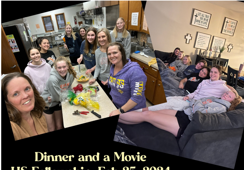
Dinner and a Movie HS Fellowship, Feb 25, 2024

We had an awesome time making burrito bowls and watching a movie together at HS Fellowship last week! These events take place monthly and are for grades 9-12. Our next event will be Sunday night, April 28 th from 5-8 PM . We don't have HS Fellowship in March due to the big youth fundraiser on 3/17.