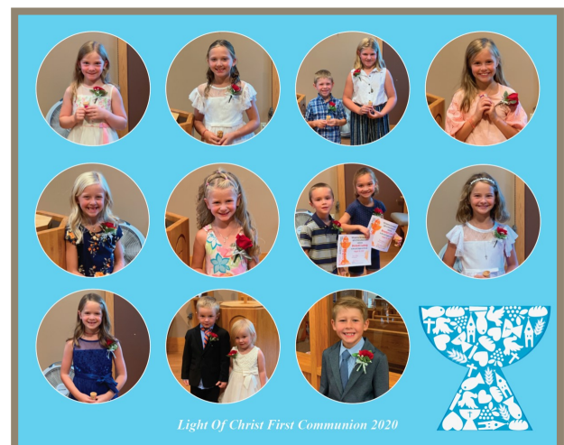
Light Of Christ First Communion 2020