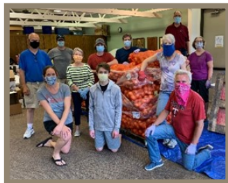
Preparation and packaging for food distribution