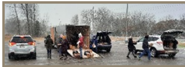
Food distribution in the church parking lot