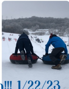
Tubing fun!!! 1/22/23