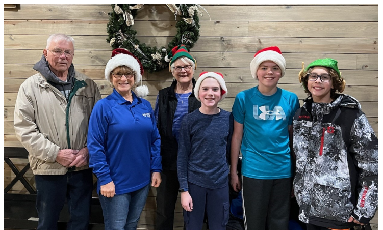
December 8 th helpers for the Love INC Christmas Sharing gift drop-off at Light of Christ.

We rely on the generous hearts of our volunteers. Thank you to all those who have volunteered in the Connection Center, Fresh Start Program, and our Love INC Heartland Thrift Stores. New to volunteering? We welcome you: bit.ly/loveincvolunteer