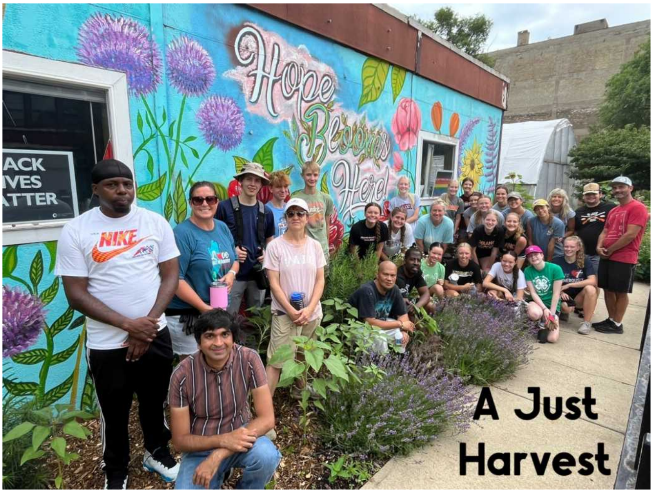
A Just Harvest